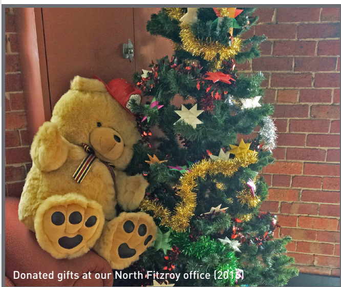
Donated gifts at our North Fitzroy office (2018)