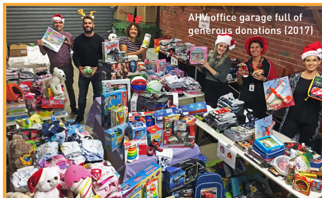
AHV office garage full of generous donations (2017)

If we can help you by providing some gifts for your children, please contact your Housing Officer or call our Client Services Team on 9403 2100 , and we will do our very best to organise some suitable gifts for you.