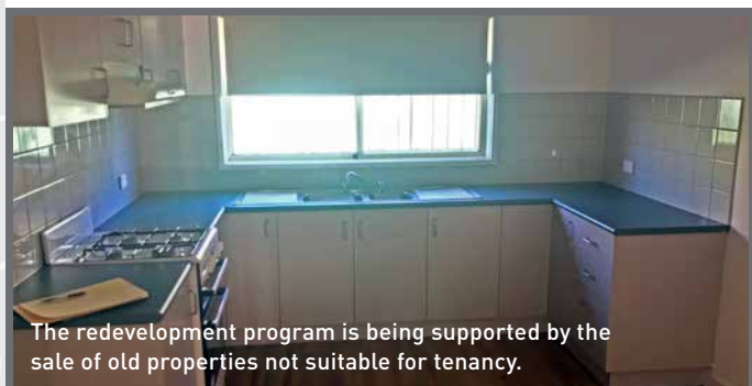
The redevelopment program is being supported by the sale of old properties not suitable for tenancy.

Construction is about to begin on another multi-unit development in Melbourne's western suburbs while two sites in the south are about to get underway. The 2018–19 major upgrades and capital program is also set to begin with 18 properties expected to receive substantial works before the end of the calendar year. A further 15 properties are likely to be included on a program that will be released during early 2019.