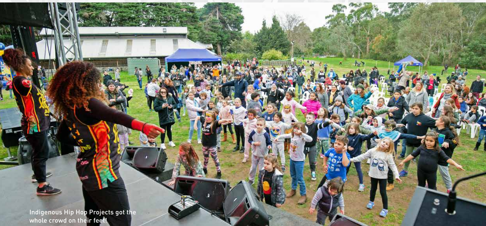
Indigenous Hip Hop Projects got the whole crowd on their feet!