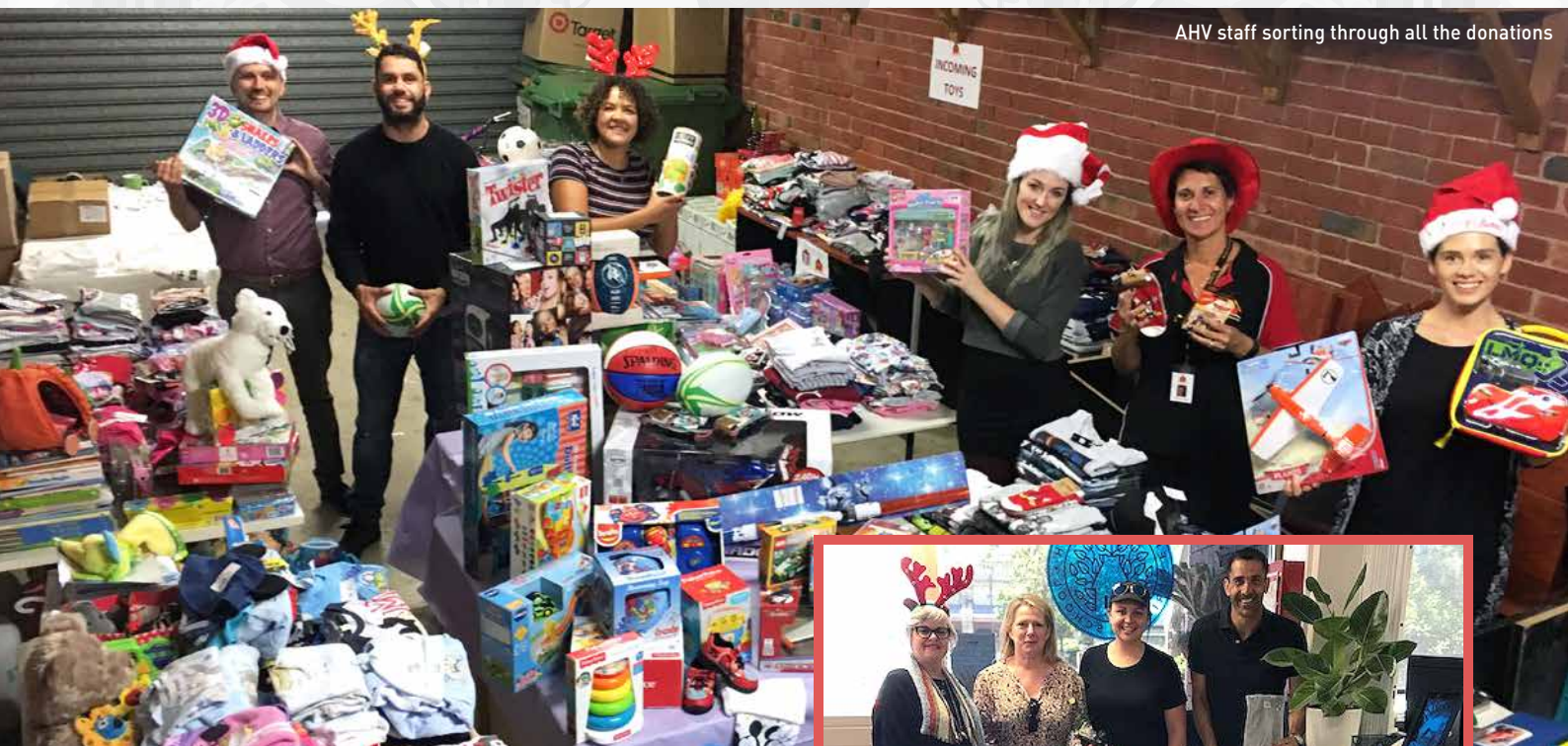
AHV staff sorting through all the donations